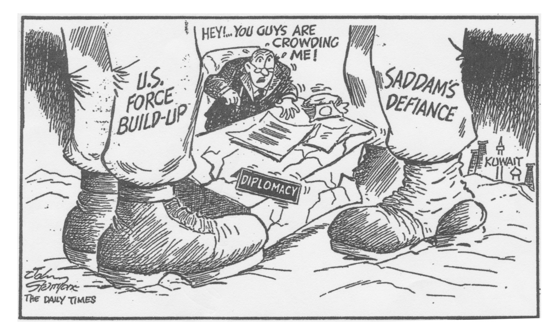
A US cartoon, published in the second half of 1990.