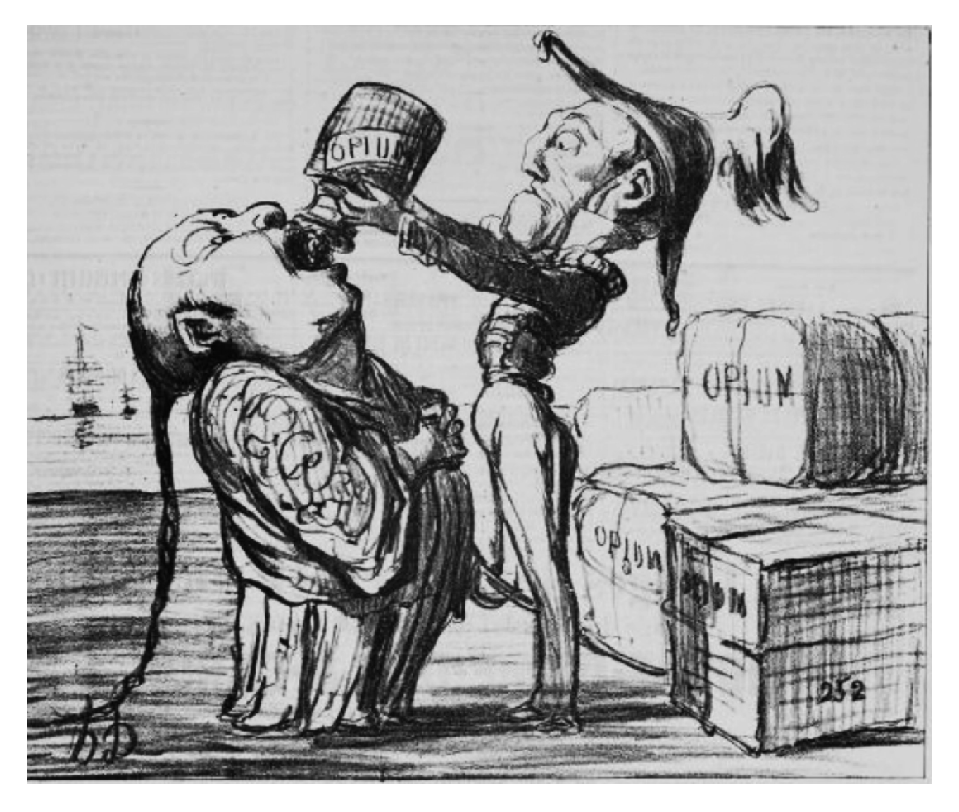
A French cartoon published in 1840. The figure on the right represents Britain.